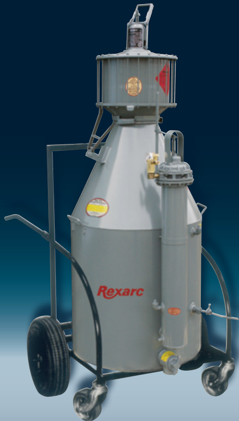
50-PS with hand truck Part No. 4-12-0022A