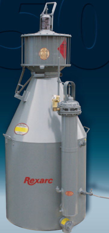
50-PS portable generator only Part No. 4-12-0018A