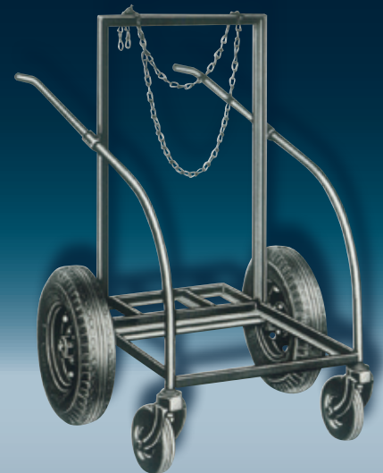
Hand truck w/pneumatic tires Part No. 3-08-0009