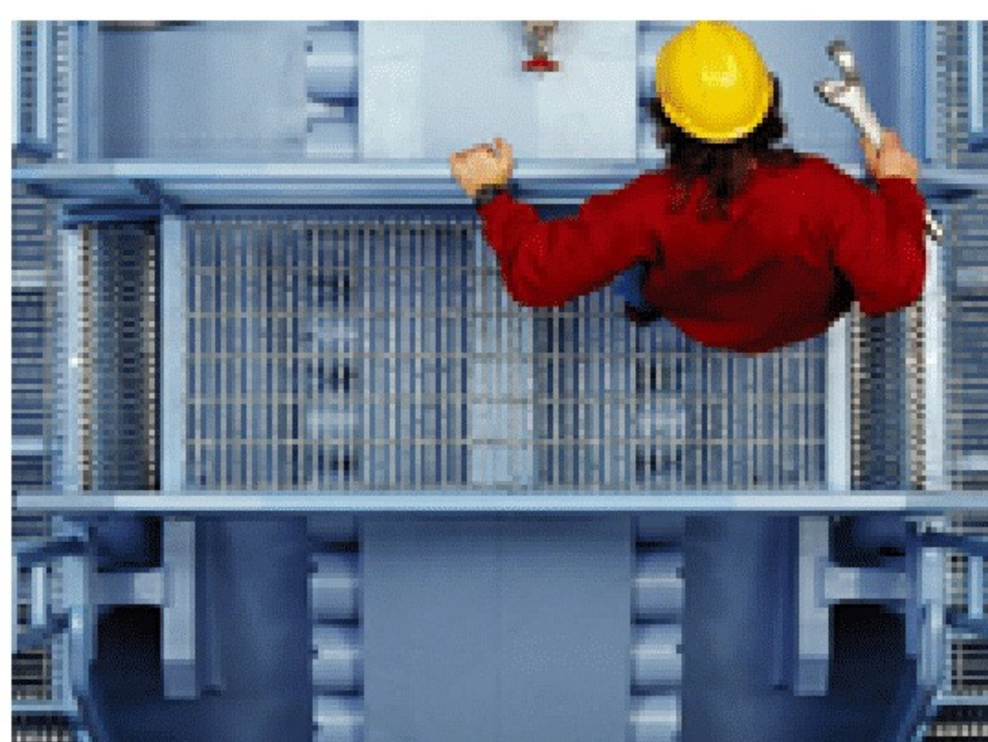
PLANT AUDIT & MAINTENANCE SERVICES