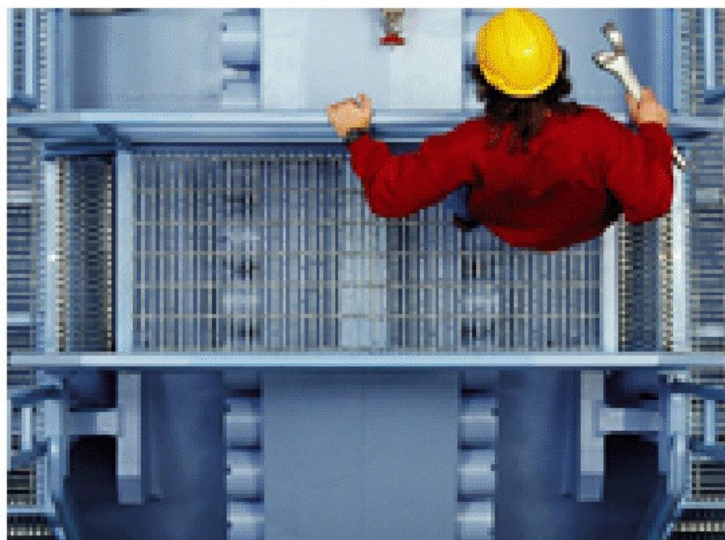
PLANT AUDIT & MAINTENANCE SERVICES